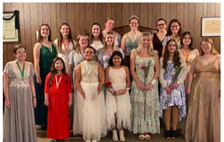
Giving the gift of Membership on December 16 in Elkhorn New members for Elkhorn/Waterloo #38, Athena #24 and Lincoln #6 365 Growth by new members in 2024 for Nebraska Rainbow